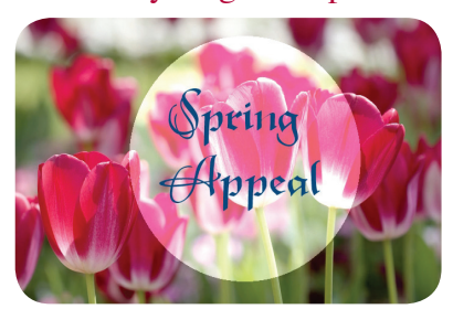
Look inside for your Spring Appeal envelope.

Help SPOHNC bring hope to a newly diagnosed patient.